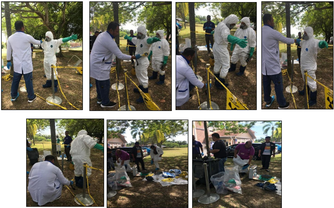
Figure 3: Decontamination process

ii Verification of Decontamination: If decontamination efforts were carried out (e.g., cleaning contaminated surfaces or equipment), the team must verify that these procedures were effective. This includes checking for any traces of radioactive material on surfaces, walls, floors, equipment, and in the air. If any traces of contamination are detected, further cleaning or remediation steps will be required before the area can be deemed safe.