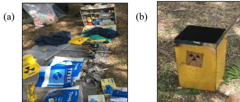
Figure 1: (a) The PPE equipment and (b) the radioactive container

to airborne radioactive particles. Face shields protect the eyes and face from potential radiation