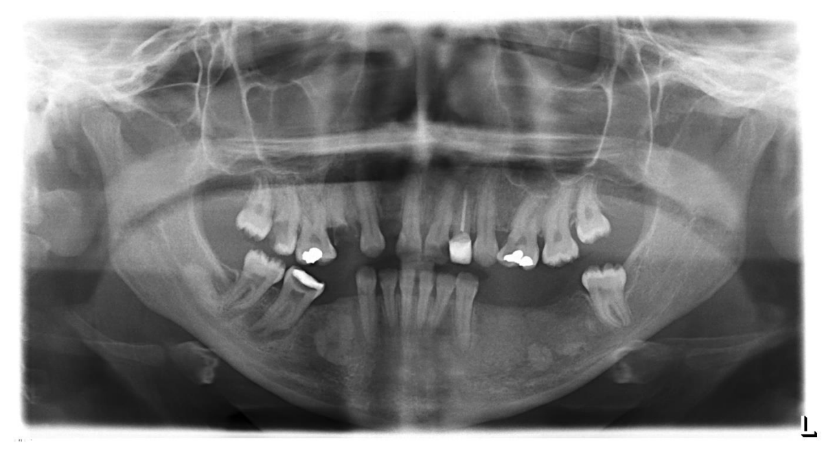
Figure 2. Panoramic radiograph showing radiopaque lesion in the lower left and right body of the mandible.