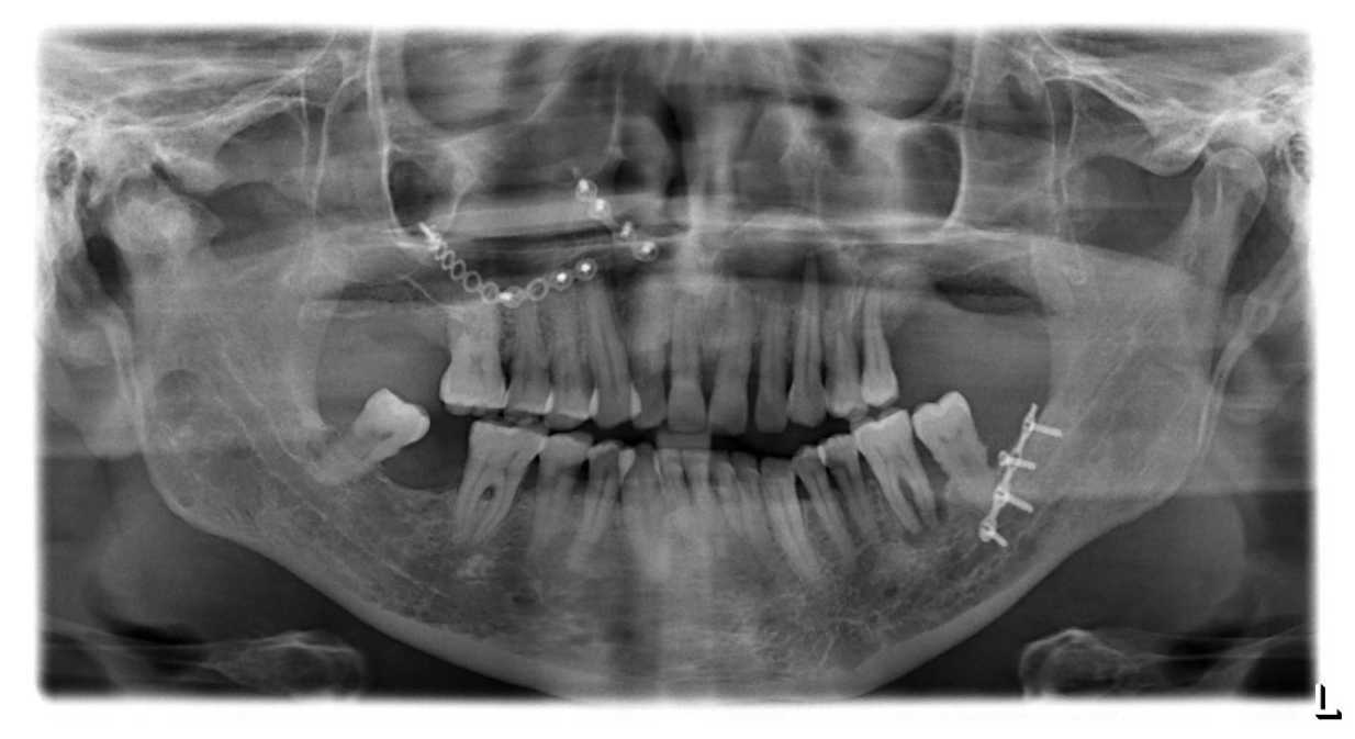
Figure 3. Panoramic radiograph showing a mixed radiolucent- radiopaque lesion in the lower posterior right angle of the mandible.