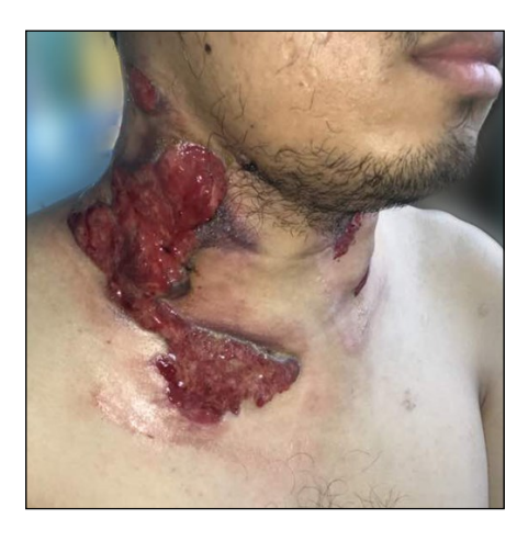
Figure 1: Large mixed ulcerative-fungating lesion of the neck

A contrasted computed tomography (CT) of the neck was done which showed multiple overlying skin breaks with a bulky right sternocleidomastoid and bilateral subcentimetre cervical lymph nodes but with no definite abscess formation (Figure 2). The non-specific findings represented either a chronic inflammation or infection. An incisional biopsy of the right neck lesion was performed. The histopathological examination (HPE) report came back as granulation tissue which was negative for Ziel-Niehlsen and Periodic Acid Schiff (PAS) stains.