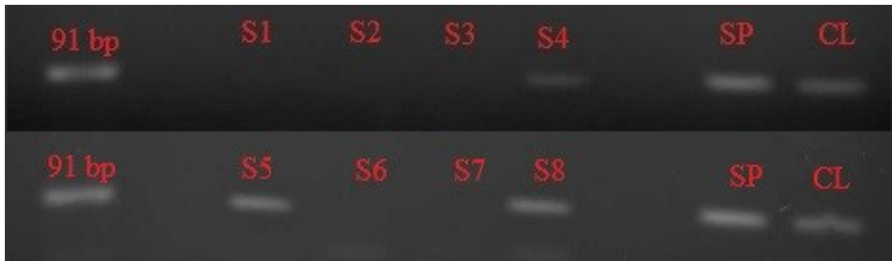
Figure 1 : Verification of PCR product ( bHCG gene) on agarose gel