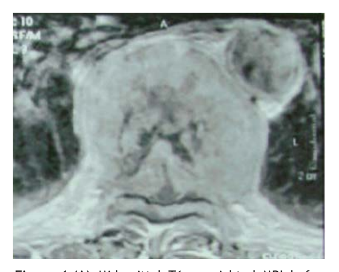
Figure 1.(A) Midsagittal T1 - weighted MRI before and (B) after gadolinium showed inhomogenous enhancement of T6 to T8 with destruction of T7 and paravertebral mass. On axial view, there is destruction of T7 with enhancing paravertebral mass. The spinal cord is severely compressed.