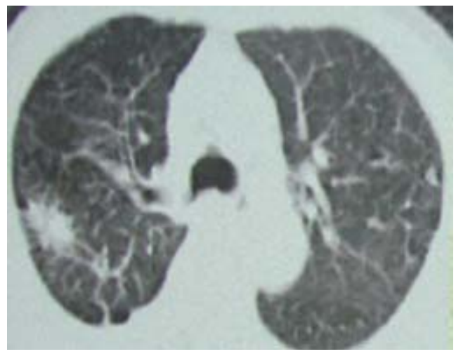
Figure 2. Axial post-contrast CT of thorax shows peripherally located specu-lated right lobe lesion consistent with lung car-cinoma.