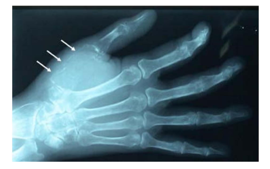
Figure I: Plain X ray of the left hand shows osteolytic destruction of the left first metacarpal bone