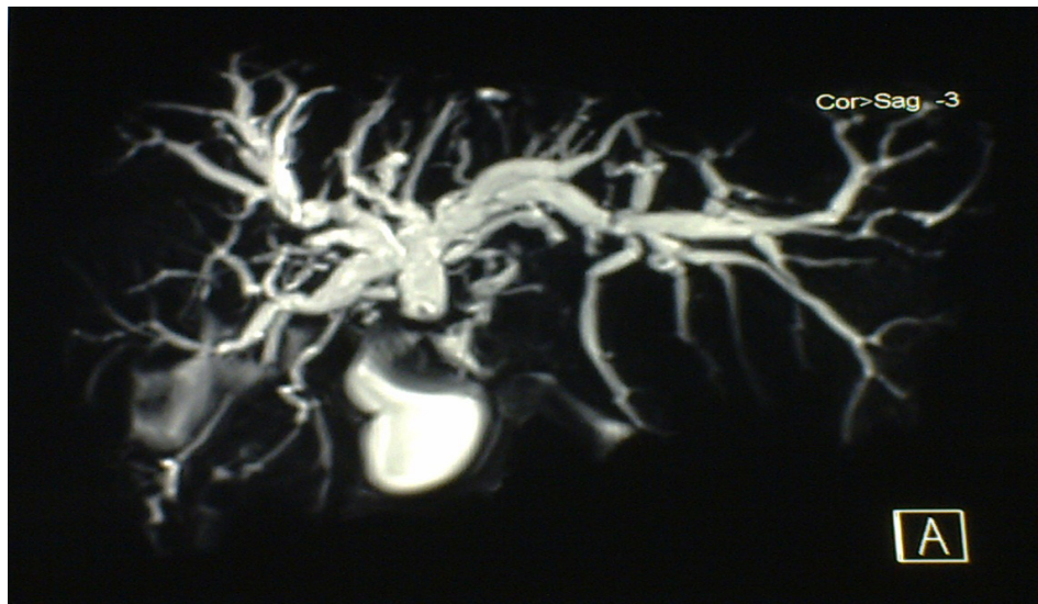
Figure 1. MRCP revealed stricture at common hepatic duct

antegrade biliary stenting to surgical biliary reconstruction. Because of that the diagnosis is often established at operation, after the surgery via histology or by PCR assay. Invariably, the treatment mandates anti-tubercular therapy.