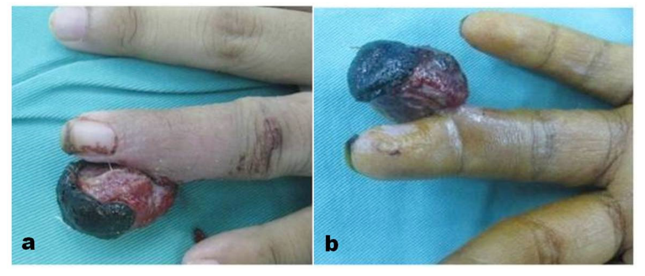
Figure 1. Illustration of the mass; a) view from dorsal aspect, and b) from volar aspect.

Movement of the interphalangeal joints of the affected finger were not restricted. There was no other skin, mucosal abnormalities or palpable lymph nodes. An inflammatory marker (CRP 3.4mg/dl) was elevated, suggesting a secondary bacterial infection.