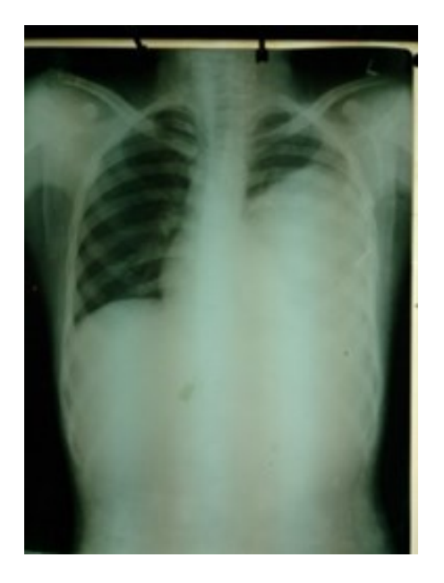
Figure 1. Chest Xray (PA view) showing It lower lung field homogenous opacity.

CECT head was normal. CECT thorax showed a cystic lesion with membrane in it, of size 10.2x7.8x6 cm<sup>3</sup> in the lower lobe of left lung. No pleural effusion was noted. CECT abdomen & pelvis revealed a large cystic lesion with membrane in it, of size 8.1x7.8x12cm<sup>3</sup> in the spleen and 3.3x2.7x2cm<sup>3</sup> in the right lobe of the liver. Other visceras was normal (Fig 2). Patient was managed with left thoracotomy on which the cyst came out spontaneously with positive pressure ventilation (Fig-3). Pleural cavity was closed over intercostal drain in 5<sup>th</sup> intercostals space. Exploratory laparotomy was also performed, in which splenic cyst was aspirated and injected with hypertonic saline. After 10 minutes, the cyst