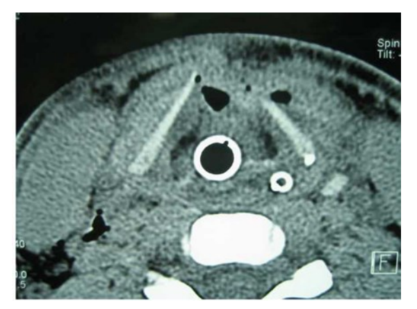
Fig.2: A CT scan revealed an open book fracture (double black arrow) of the anterior portion of the left thyroid lamina with some degree of soft tissue emphysema.

All associated cervical and esophageal injuries must be carefully evaluated initially. Flexible fiberoptic laryngoscopic assessment can be safely performed to evaluate the upper airway condition during initial evaluation at the accident and emergency setup. Complete assessment by endoscope and CT scan before reconstruction is mandatory to assess the extent of endolaryngeal injuries and fracture condition of the cartilaginous framework. A CT scan is a sensitive and diagnostic procedure for ELT trauma and may be indicated despite normal flexible laryngoscopy. A CT scan is helpful for identifying the extent of structural abnormalities and for surgical planning.<sup>8</sup> Fracture of the laryngeal cartilaginous framework is the determining factor for reconstruction. CT scans are also useful for assessing poorly visualised areas such as the subglottic and anterior commissure and for identifying cervical spine injuries.