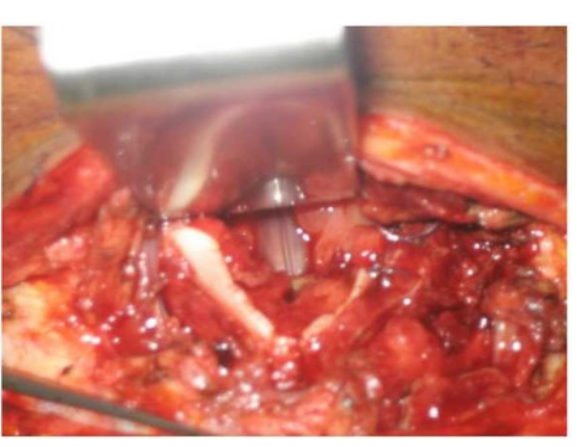
Fig.3: Intraoperative approach to the endolarynx tissue via the midline. An endotracheal tube (black arrow) acted as a stent to stabilise the unstable fracture thyroid cartilage.