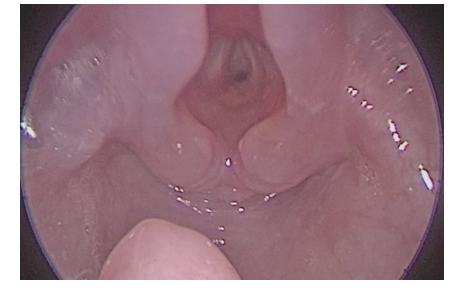
Figure 1: Case 1 Endoscopic view of the Subglottic stenosis

A 1 year 2 months old girl was diagnosed with grade II Cotton-Myer subglottic stenosis (Fig.1) and gastroesophageal reflux disease (GERD). She was born prematurely with multiple hospital admission for airway related issues and was finally referred to ORL-HNS clinic. Balloon dilatation was done (Fig.2) and the immediate result after dilatation (Fig.3).