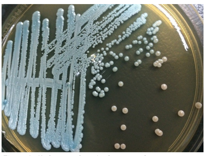
Figure 2: Kodamaea ohmeri colonies on chromogenic agar after 5 days of incubation.