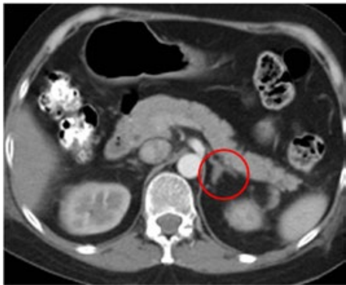
Figure 3. CECT abdomen showed bulky heterogeneously enhancing left adrenal gland with focal hypodensities within, suggestive of left adrenal adenoma.