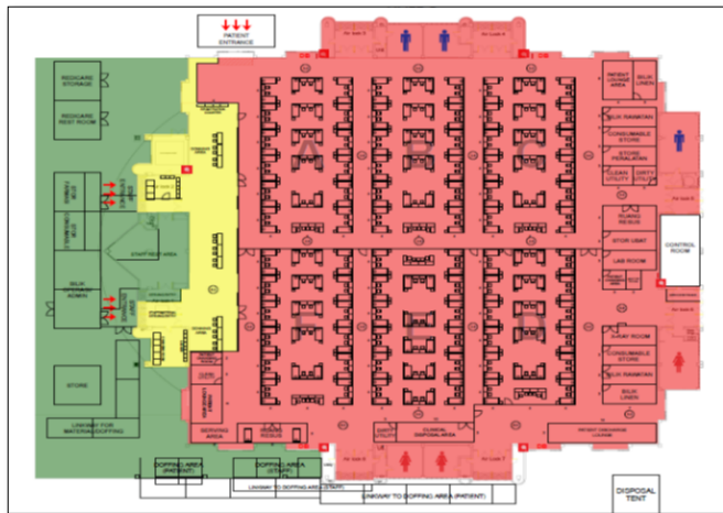
Figure 2. PKRC zoning area in a hall that was converted into Covid-19 ward according to three zones viz red: high risk, yellow: moderate risk, and green: low risk zones.

agencies were randomly chosen to undergo swab testing for Covid-19 to assess for possible workplace exposure. Approximately 520 of them (representing nearly 50% of total staffing) were swabbed and all results reported were negative.