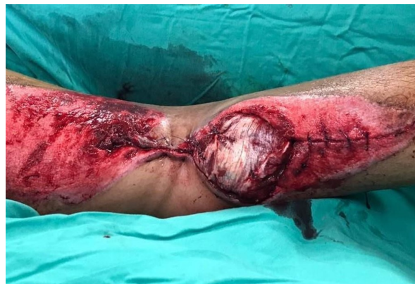
Figure 1B A lateral gastrocnemius flap was raised to cover the anastomosis during the same surgery

Gastrocnemius muscles flap were first popularised by Ger for the treatment of soft tissue defect following open fracture and osteomyelitis. The surgical technique is easy because the plane between the gastrocnemius and soleus muscle are relatively avascular. It does not require any magnification instrument and the vascular