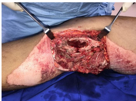
Figure 1A 20-year-old man (case number 28) had a popliteal artery injury following a motor vehicle accident. He had a 10 X 5 cm wound at the popliteal fossa. Two cm of the popliteal artery was resected and replaced with an interposition saphenous vein graft.

In these procedures, it was observed that there was no flap necrosis among the patients assessed. Complications including persistence infection in three patients which required advancement of the flap (1) and additional fasciocutaneous flap (2) to cover the wound breakdown. All the fractures well united and only one patient who had an infection following double plating for tibial plateau fracture developed chronic osteomyelitis. One of the patients developed transient peroneal nerve palsy following the lateral gastrocnemius transfer. Both patients who had patella ligament reconstruction with gastrocnemius flap develop knee stiffness. One schizophrenic patient eventually underwent above-knee amputation due to infected non-union of the distal femur.