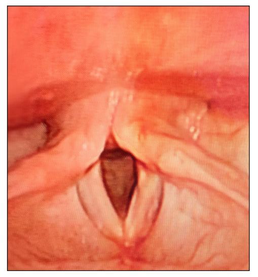
Figure 3: Postoperative endoscopic view of bilateral normal vocal cords.

In postoperative assessment, the patient's voice has returned to near normal a week post-procedure. His voice handicap index-10 (VHI-10) was within the normal range (total score, 5), GRBAS scale (Grade, Roughness, Breathiness, Asthenia, Strain) showed slight deviance in grade and roughness and maximum phonation time was 18 seconds. The repeated flexible nasopharyngeal laryngoscope was unremarkable (Figure 3). The patient was then given follow up in our clinic three monthly for surveillance. He is currently disease-free through one year follow up.