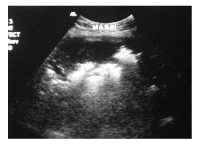
Figure 1. Transverse sonogram of the uterine mass showing internal echoes and reverberation artefact from gas suggestive of pyomyoma.

An enhanced helical CT scan of the abdomen and thorax were performed to evaluate the abdominal mass and to look for possible metastasis. Ring enhancing lesions due to abscesses were visualized in the spleen and right psoas muscle. The pelvic mass measured 13cm x 16.5cm x 19.2cm and originated from the uterus. It has thick wall, cystic component and gas [Figure 2]. There was a cystic collection on the left of the urinary bladder [Figure 3]. Thromboses were noted in the right and left femoral veins. The mass was diagnosed to be a pyomyoma. CT scan of the thorax showed few thromboses in the right and left pulmonary arteries consistent with pulmonary embolism. There was no mass in the mediastinum and lung parenchyma.