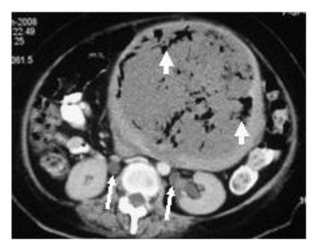
Figure 2. CT of pyomyoma showing the fluid filled content with collection of air within it. Dilated ureters are shown (long arrows).