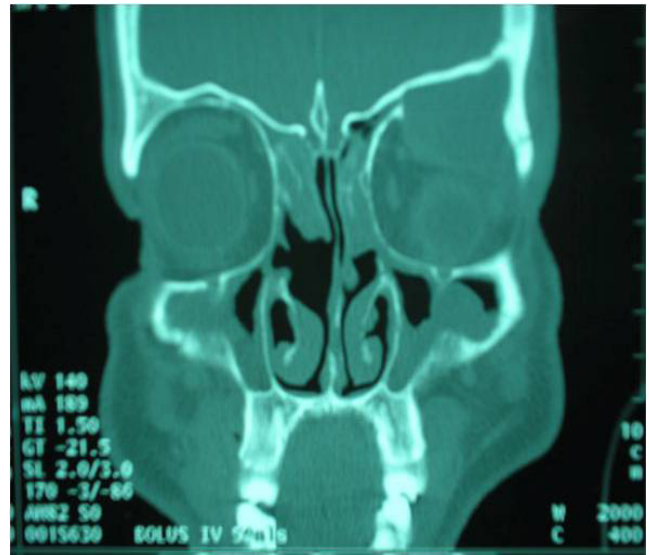
Figure 1. Computed tomograph (CT) scan revealed an extraconal lesion at the superolateral part of the left orbital cavity.

Computed tomograph (CT) scan revealed an extraconal lesion at the superolateral part of the left orbital cavity which pushed the orbit inferomedially (Figure 1). The mass was in continuity with the left frontal sinus mass through the defect in the superior orbital wall. There was also underlying pansinusitis with polyps in the middle meatus, maxillary antrum, ethmoids and frontal sinuses. He was offered surgical removal of the left frontomucocele.