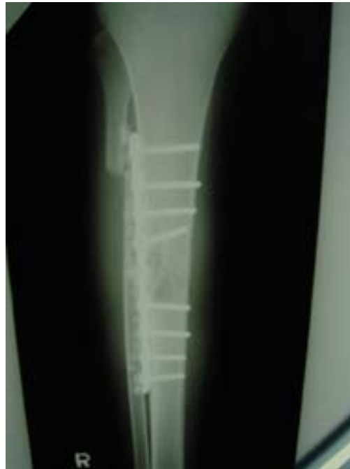
Figure II. Plain radiograph showing plate at the lateral border of the tibia with antibiotic beads