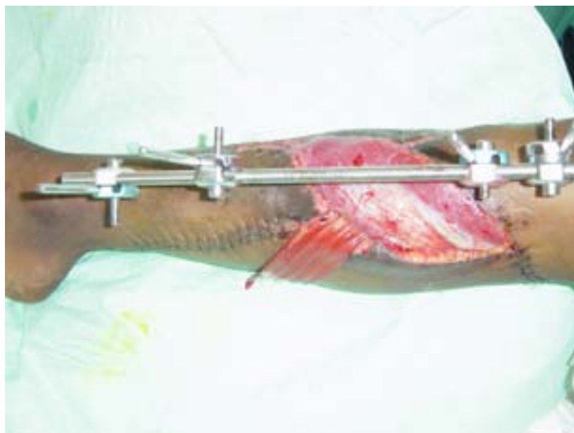
Figure IV. Clinical photograph following wound closure with gastrocnemius muscle flap