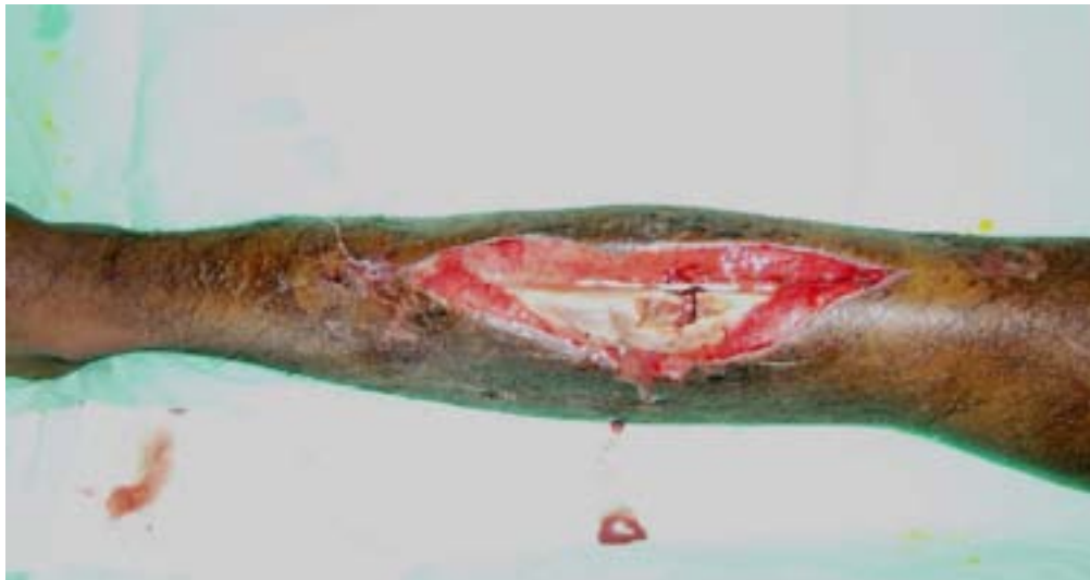
Figure III. Clinical photograph of infection with an exposed bone and metal implant