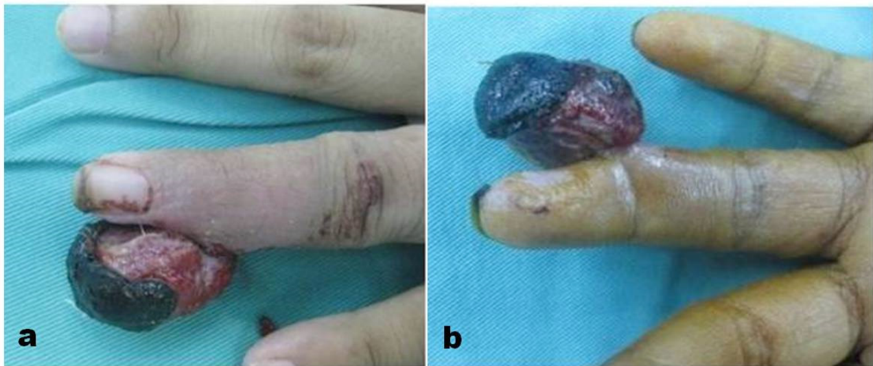
Figure 1. Illustration of the mass; a) view from dorsal aspect, and b) from volar aspect.

Movement of the interphalangeal joints of the affected finger were not restricted. There was no other skin, mucosal abnormalities or palpable lymph nodes. An inflammatory marker (CRP 3.4mg/dl) was elevated, suggesting a secondary bacterial infection.