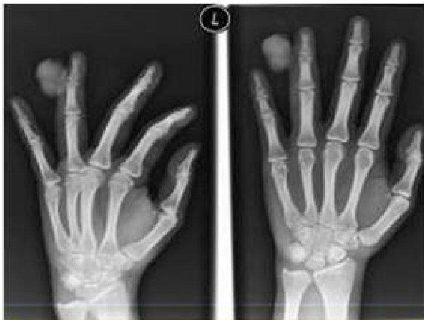
Figure 2. Hand radiographs showing a radiopaque mass without bony involvement.

She completed a one week course of cloxacillin. Radiographs did not show any bony erosion although the mass was radio-opaque suggestive of calcified material (Figure 2).