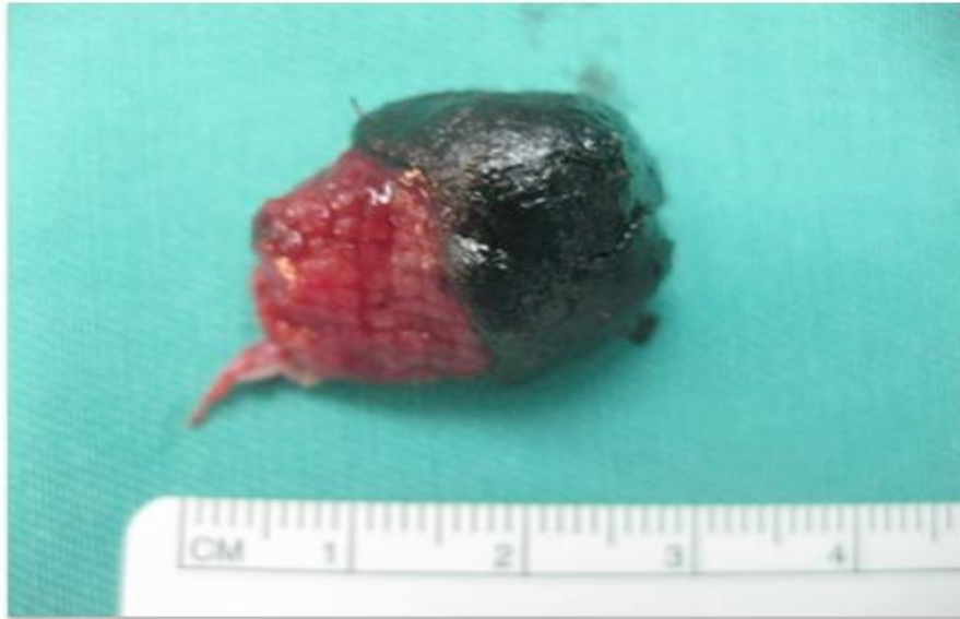
Figure 3. Gross specimen of the excised mass with the presence of granulation tissue over the base and necrotic tissue superiorly