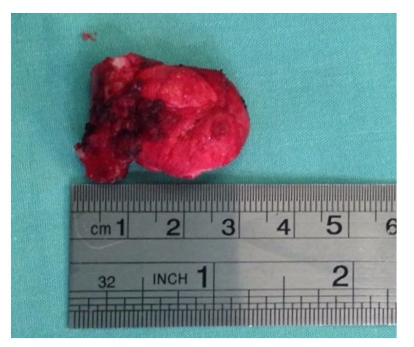
Figure 2 Calcified thyroglossal duct cyst