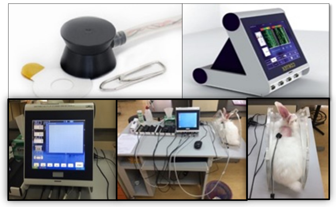
Figure 1: DermaLab skin elasticity suction probe (Cortex Technology, Hadsund, Denmark)