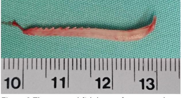
Figure 3 The serrated fish bone after removal, measuring 3.0cm, showing unidirectional saw-tooth on one side.