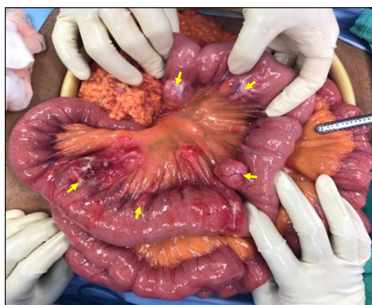
Figure 2: Multiple broad-based diverticulae at the jejunum (yellow arrows)

jejunal diverticulosis may become symptomatic. 1,3 The clinical presentation of complicated jejunal diverticulosis or perforation is variable, which includes chronic crampy abdominal pain, diverticulitis, abscess formation, bleeding, fistulation, mechanical intestinal obstruction, and perforation. The incidence of jejunal diverticulitis ranges from 0.02% to 0.42%, with 2.1% to 7.0% of patients present with severe sequelae of perforation. 4,5