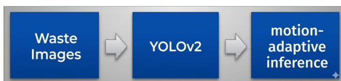
Fig. 4 Procedure for the Fast YOLO classification of organic and recycle materials

The Fast YOLO comprised of the optimized YOLOv2 and the motion-adaptive inference. Each of the frame is fed to 1D convolutional layer. The convolutional layer produces the motion probability map (see Figure 4). Subsequently, transmit it to motion-adaptive inference to find out if computation to updated class probability map requires deep inference. The deep inference is perform only when required to fasten the rate of object detection [34].