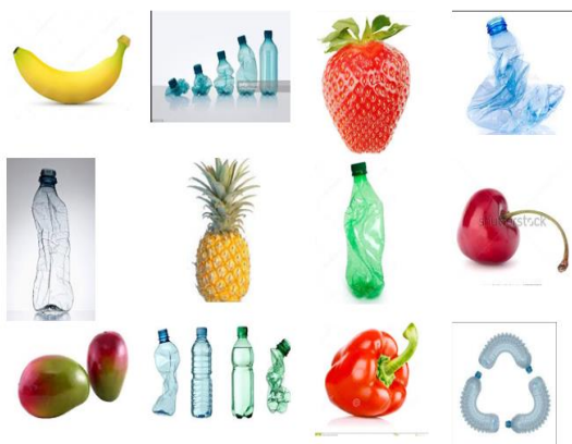
Fig. 3 Sample of the waste comprising of organic and recycle materials

The data used in this study contained images of waste involving organic and recycle materials, the sample of the data is presented in Fig. 3 The data is publicly available online through Kaggle as waste classification. The data has 25077 organic and recycle images [41].