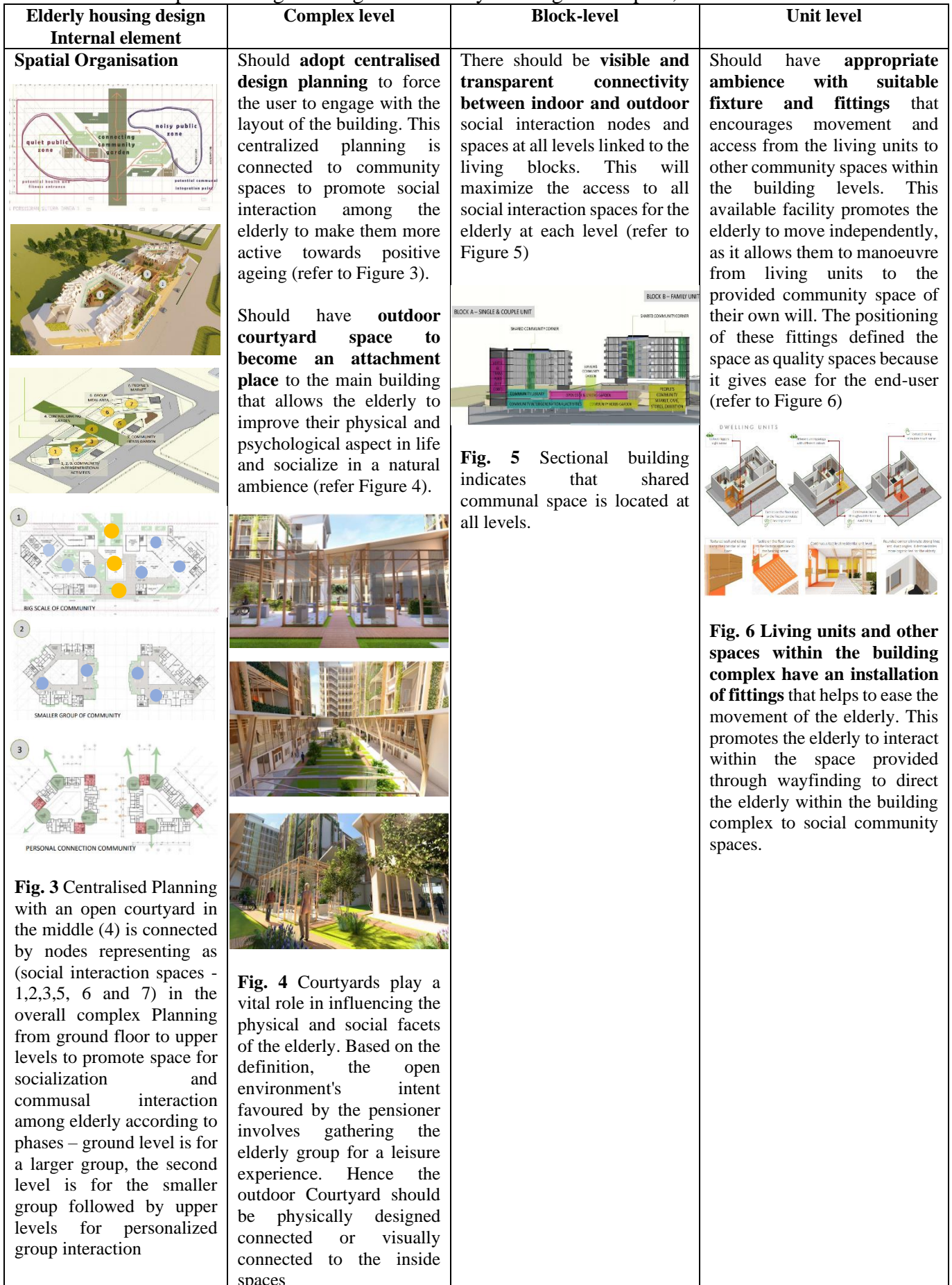
Table 6 Proposed Design Strategies for elderly housing at Complex, Block and Unit Level