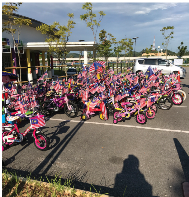
Figure 8 Recreational Activities

Smooth concrete pavement can be a medium for cycling, riding scooter and roller blade activities. This will also help in practicing a healthy lifestyle and to create a social point for community engagement. The effectiveness of the proposed project would expect to pull the crowd, particularly during festive weekends and holidays. The vibrant surrounding development and new look of this area are positive outcomes that could attract a wide range of users to the place, such as youth and families.