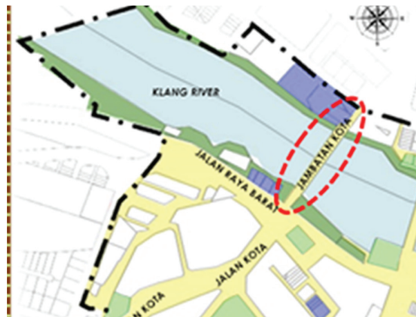
Figure 2: Location plan of the site