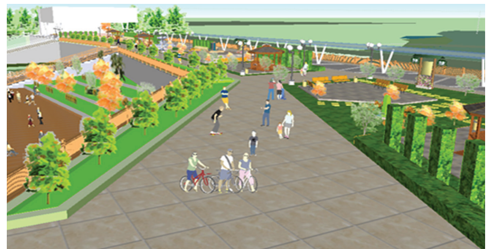
Figure 5 Landscape element

The bridge is designed with shady trees, shrubs and green box to enhance the greenery view.