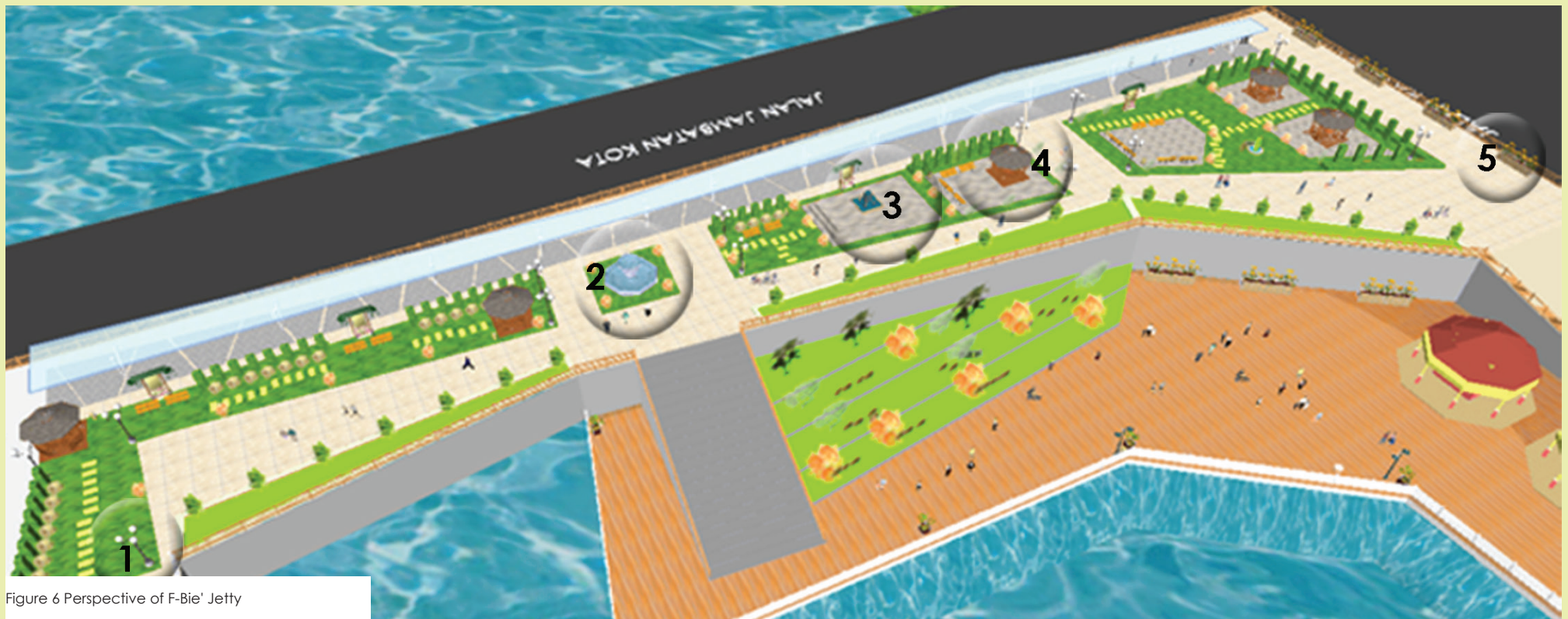
Figure 6 Perspective of F-Bie' Jetty