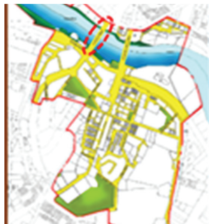
Figure 1: Key plan

The project aims to design the Special Area Plan for Klang Royal Town in Selangor. The area includes Kg. Delek, Telok Gadong, Teluk Pulai, Taman Sentosa, Seri Andalas, Klang Jaya and Kg. Jawa. The new concept of F-Bie' Edge Jetty is proposed to create a new node for social and physical enhancement among community. The facilities and physical elements are designed to promote a healthy activities and lifestyle.