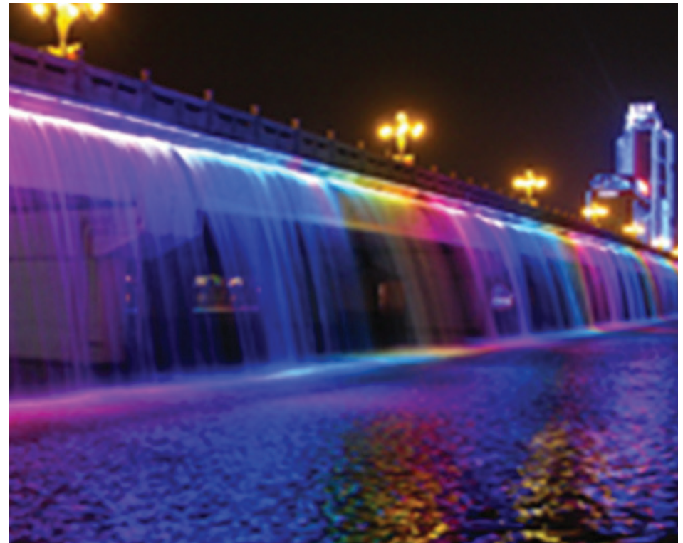
Figure 4 Water Feature

Availability of existing Klang river and landscape area such Taman Pengkalan Kampar and Taman Pengkalan Batu for new improvement and development.