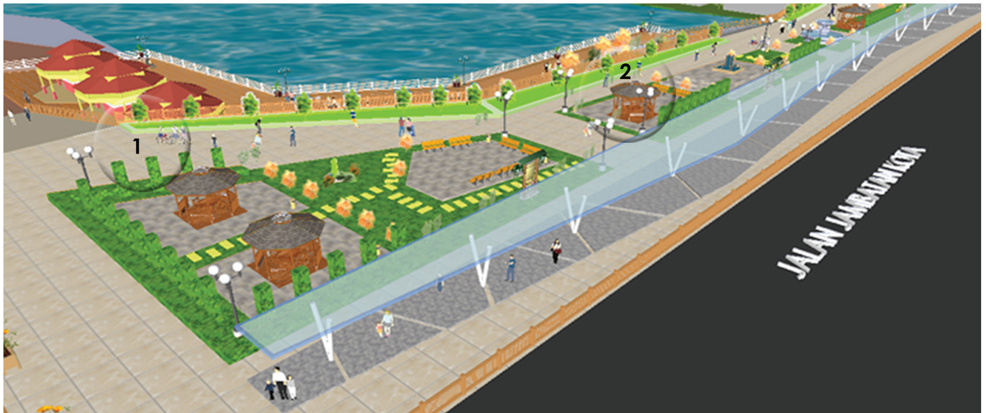
Figure 7 perspective of F-Bie' Jetty