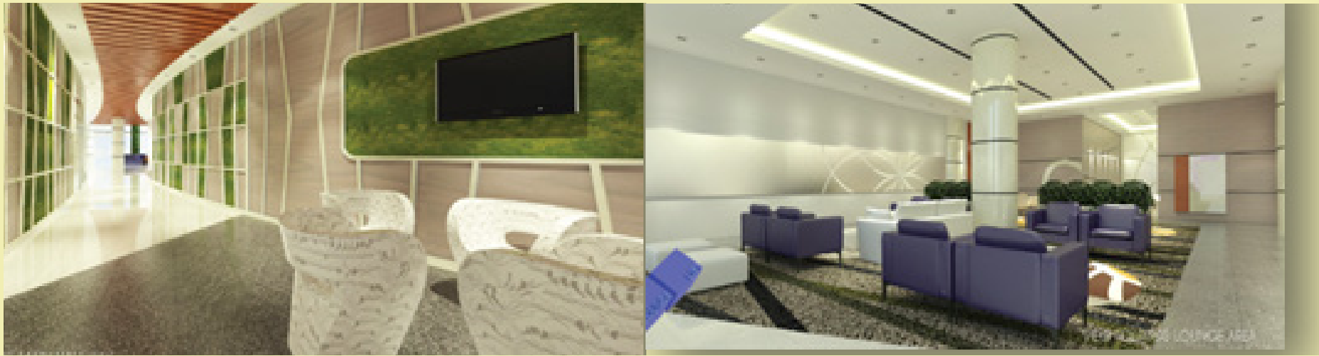
Figure 5 Corridor and lounge area with implemented of natural element