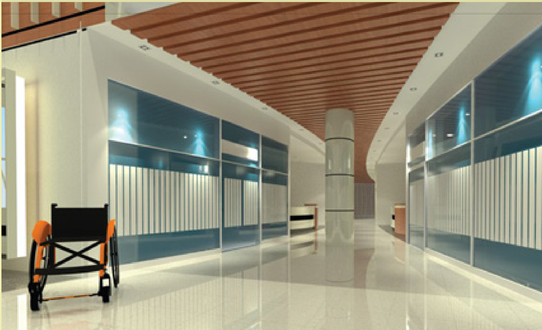
Figure 7 Hall way to café area