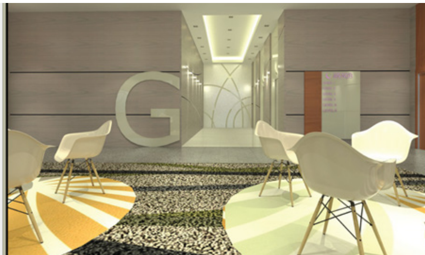
Figure 9 Main Lobby