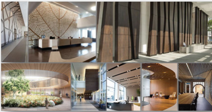
Figure 8 Mood Board and Proposal of Material Selection