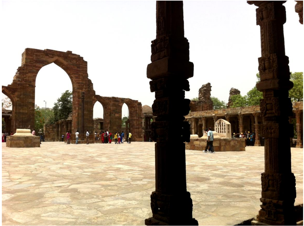
Remains of Qūwwat al-Islam Mosque in New Delhi. Materials from 27 Hindu and Jain temples demolished in the neighbourhoods were used for constructing the mosque.