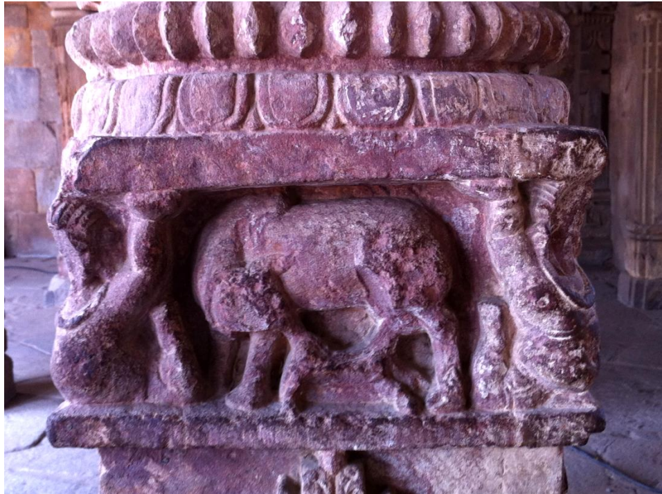
Disfigured image of a cow on one of the columns inside Qūwwat al-Islam Mosque.

Cow is the most sacred animal for Hindus. It symbolizes good nature, purity, motherhood and prosperity.