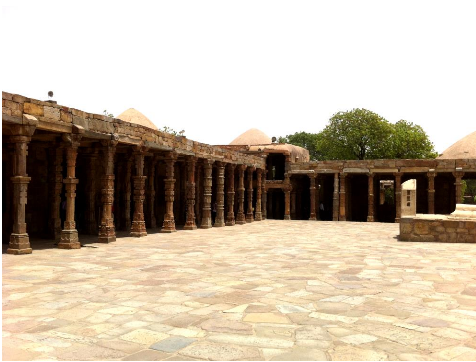
The courtyard and riwāqs (arcades) of Qūwwat al-Islam Mosque. The riwāqs were formed by superimposed, or placed one above the other, Hindu columns.