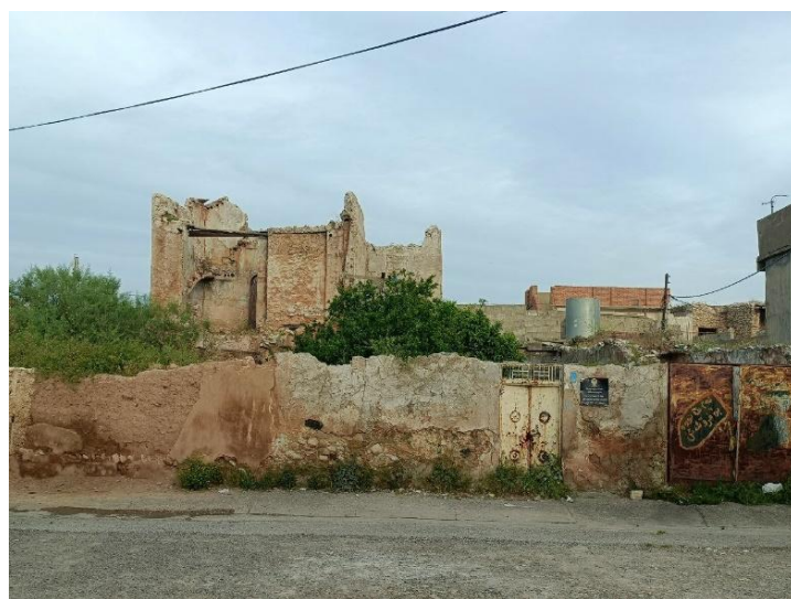
Figure 2: The remains of the Jewish quarter in Koya