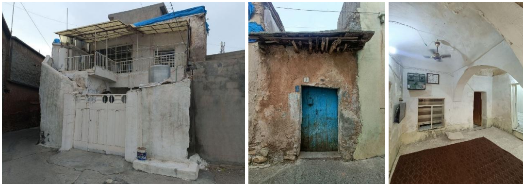
Figure 4: The remains of Jewish houses in Koya