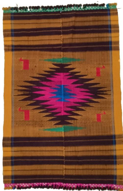
Figure 6: The remnants of sejade created by Jolla