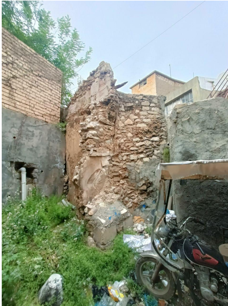
Figure 1: The remains of the Jewish temple