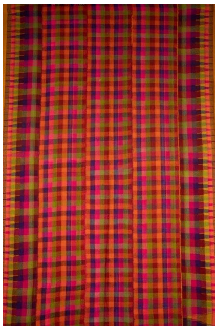
Figure 5: The remnants of jajim created by Jolla

brides and grooms (see Figures 5, 6, & 7). They built drapes specifically designed for the children with the purpose of shielding them from both the chilling cold and the scorching heat of the sun (see Figure 8). Overall, the blankets included various patterns, such as butterflies and deer. Additionally, the sejade , which was made by Muslims, featured minarets that symbolised those of the mosque.