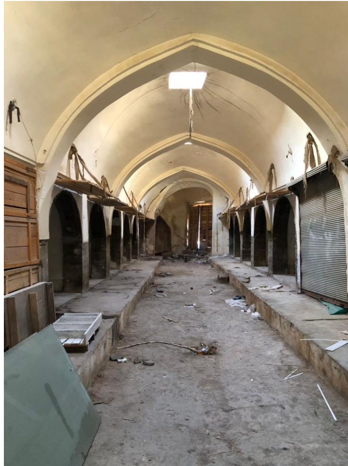
Figure 3: The remains of Jewish stores in the Koya grand bazaar