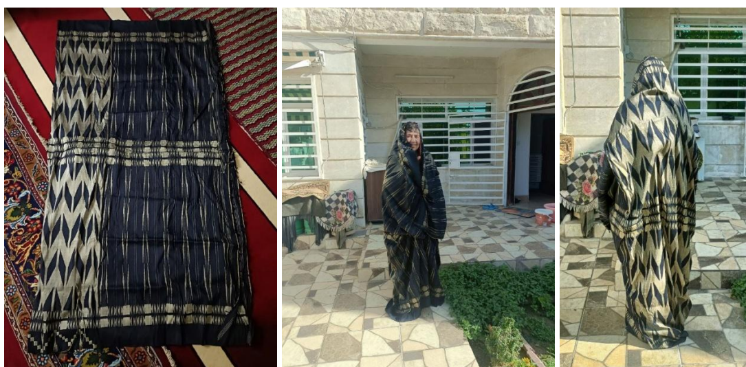
Figure 10: The Charshi u Kambari clothes