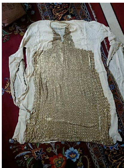
Figure 9: Kurdish clothes were sewed by Jewish tailors