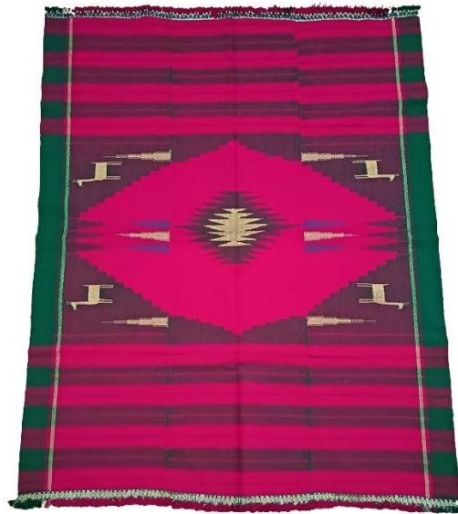
Figure 7: The remnants of blankets for new brides and grooms created by Jolla