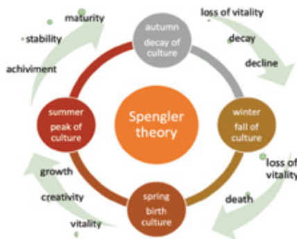
Figure 2: Oswald Spengler’s Theory of Civilisation