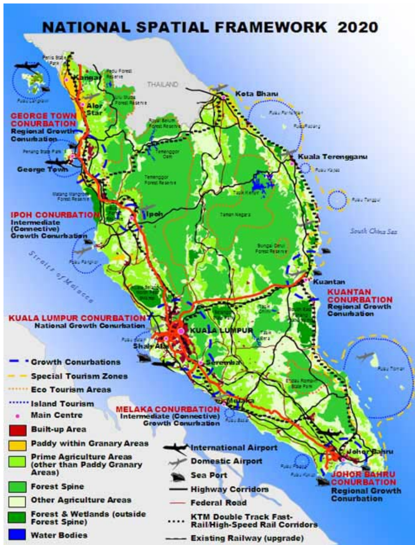
Figure 2: Malaysian National Spatial Framework 2020