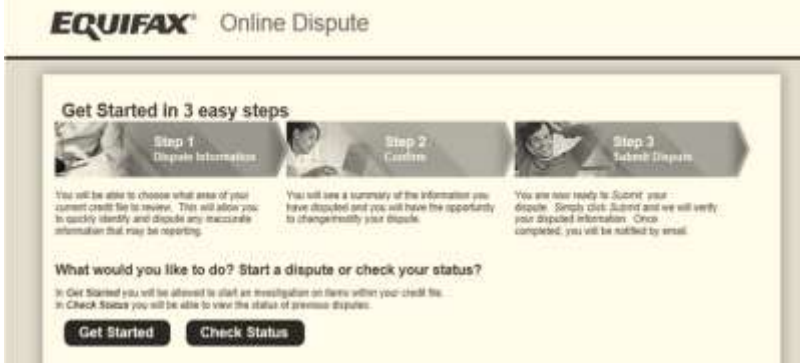
Figure 2: Equifax ODR Interface

The Equifax Online Dispute comprises three-steps mechanism for submission of complaint which must be resolved within 30 - 45 days after submission. The online dispute mechanism is one of three other dispute resolution mechanisms. Others are dispute resolution by phone and dispute resolution by mail. Figure 2 shows the interface for submission of new dispute and checking the status or progress of existing disputes.