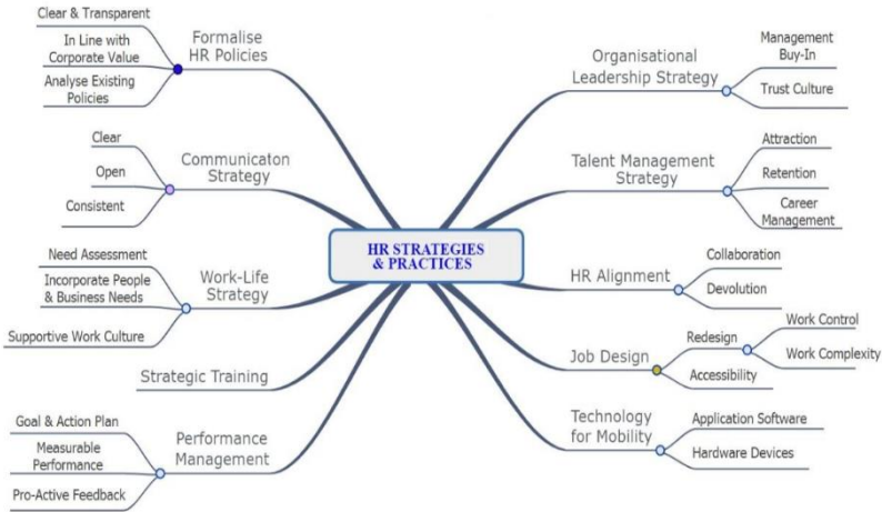
FIGURE 2 HR Strategies and Practices in FWAs