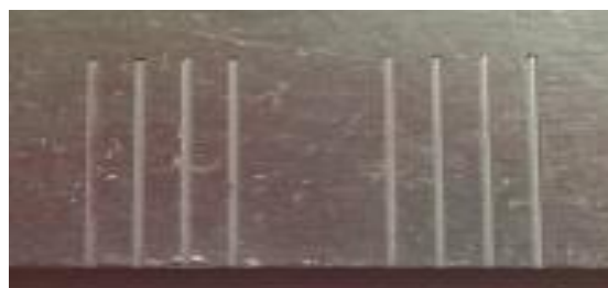
Fig. 2: Selected machined microchannels on aluminum alloy 1100.