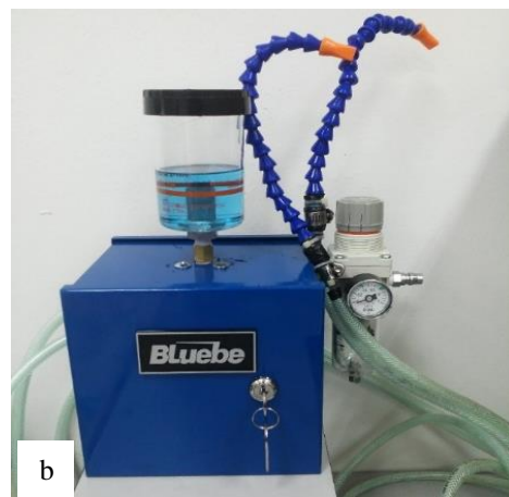
Fig. 1: (a) Integrated multipurpose machine Tools (DT-110) and (b) minimum quantity lubrication system (Bluebe FK).