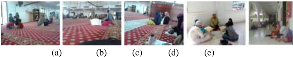
Fig.3. Children's activities - at the back of the main prayer hall (a – c), and at the corridor (d – e)

Images in figure 3 are examples of children's locations and activities. It is also interesting to see that the corridor is also used for children to learn to recite Al Quran monitored by their Ustaz (figure 3-d).