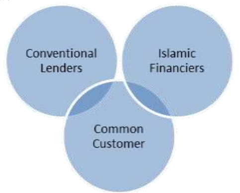
Figure 1: Relationship in a Multi-Creditor situation

The position of Multi-Creditors comprising Islamic financiers and conventional lenders can be depicted by way of a Figure 1 below: